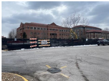
Road closure on Agricultural mall Drive

The presence of construction across campus is something that many students pay no attention to, other than the fact that it sometimes makes daily life more annoying. From things like closed roads to loud noises or restrictions in parking spaces.