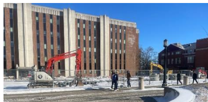
Heavilon Hall demolition

this has been painfully true for one reason. In the summer of 2022, the Purdue University Board of Trustees approved a comprehensive 10-year plan for major developments across the university. This plan included new housing for freshman, as well as renovations for classrooms, and laboratories across campus.