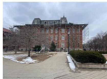
University hall renovations

The birth rate in the US during the 2008 financial crisis dropped off significantly and has been slowly decreasing ever since. 2008 was seventeen years ago. Or one year less than the age of a college freshman. So, over the next few years as the number of students decreases in our universities, the universities will have to fill their empty seats. With more international students. Which under this administration seems unlikely. Or attract enough students to stay afloat.