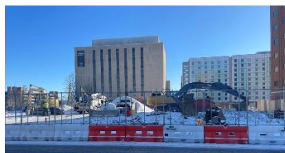
Daniels School of Business construction.

The reason for this investment is due to the pressure that many colleges in the US will soon be facing. The pressure to attract perspective students among colleges is due to one fact. There are less of them now.