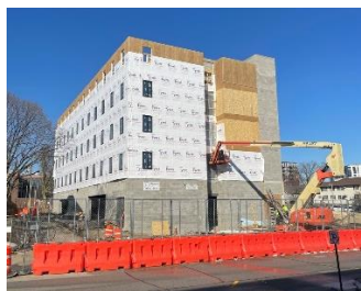
Harrison Street Construction.

For me personally the project that annoys me the most is the new apartment building that is being built across the street from where I live.