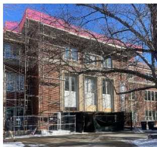
Stewart Center Construction.

For the average student this seems like a great investment in the future of the university. But for Purdue administrators this is an investment of necessity.